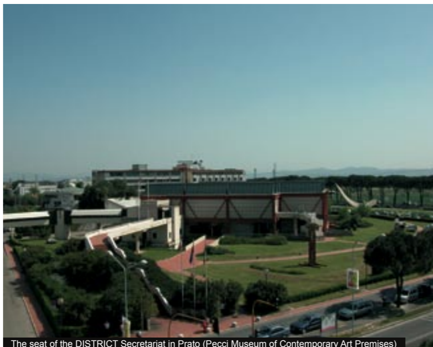
The seat of the DISTRICt Secretariat in Prato (Pecci Museum of Contemporary Art Premises)