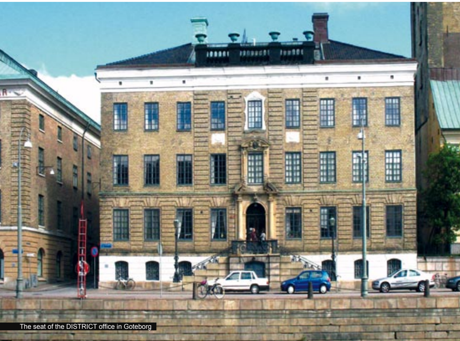
The seat of the DISTRICT office in Göteborg

a study tour was organized to visit Infineon Technologies Dresden. The 4th largest chip producer in the world ranking of the semiconductor industry operates its production in Germany in the northern area of Dresden. This industrial settlement of microelectronics is a best practice in Saxony. In co-operation AMD and Infineon have established the joined AMTC photomasc production. Research and development premisses are in the midst of the industrial park. Infineon employs over 5500 workers. The importance of the SME supplier network and technology transfer were explained to the DISTRICT/REVITAE delegation. The production process includes about 400 steps started from the wafer up to the final product: the chip. While the tour inside the company, the automation could be seen by visiting the assembly. To learn from that high innovative management, taken all dependancies and needs of coordination into consideration, the DISTRICT participants could gain certain ideas generating the components sub-project design.