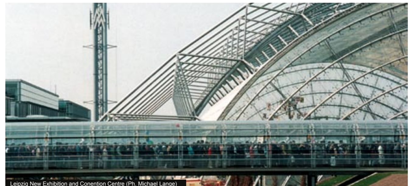
Leipzig New Exhibition and Convention Centre